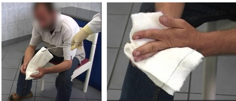
Figure 3. Procedure for sampling the smell of a suspect on a napkin