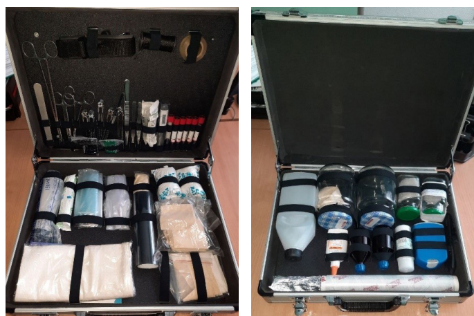
Figure 2. Selected samples of Ukrainian-made olfaction suitcases (a set)

A dog handler is employed at the scene to collect olfaction information. At the same time, a forensic olfaction expert or other veterinarian may be involved in the examination of the scene (Yatsenko, 2022). These persons carry out professional manipulations at the crime scene without the use of detector dogs. Such specialists understand the specifics of collecting scent traces and have the appropriate skills, including working with technical forensic equipment, such as special olfaction suitcases (Fig. 2). The combination of specialist work and technical resources for the collection of human odour traces has been documented in scientific research (van Dam et al. , 2019). Forensic experts are not authorised to use their detector dogs to collect scent traces. This is because these special dogs are used during olfaction research. This approach does not comply with the provisions of legal proceedings (in particular, the use of a single biological detector during the examination at the scene and in further investigative (search) actions, conducting an olfaction study, allows lawyers to claim bias of experts and examination tools – special dogs). In this regard, researchers also note the different interpretations of evidence obtained through the use of specially trained dogs by state legislation (Zarosylo et al. , 2020).